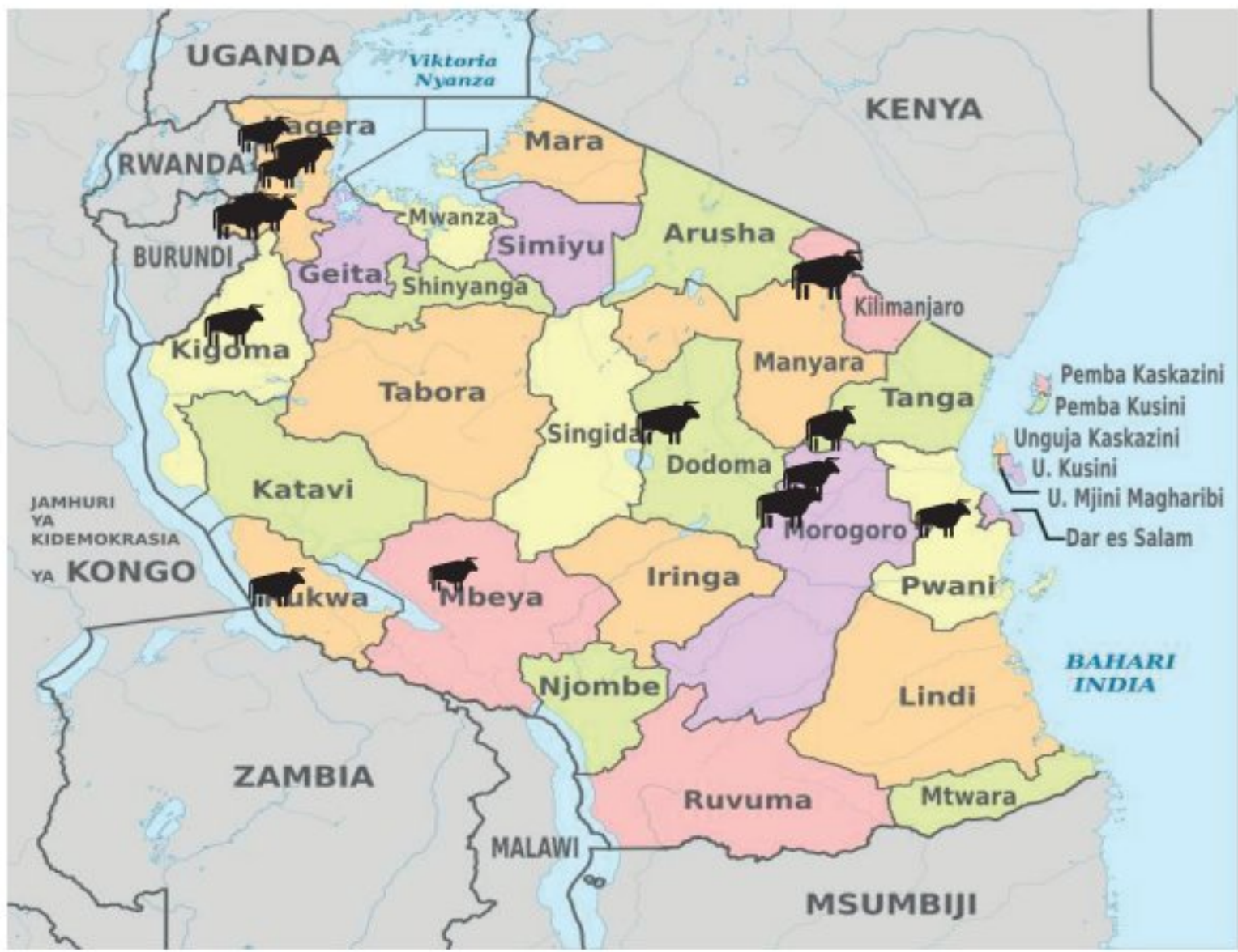
Fig. 1: Map of Tanzania: Distribution of Ranches owned by NARCO